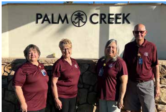
Pictured (L to R)

My F+B and gaming experience was earned in Las Vegas, where I spent nearly 40 years. My interests are motorcycles, the outdoors, fitness, music, and sports. I look forward to meeting and serving the Palm Creek community.